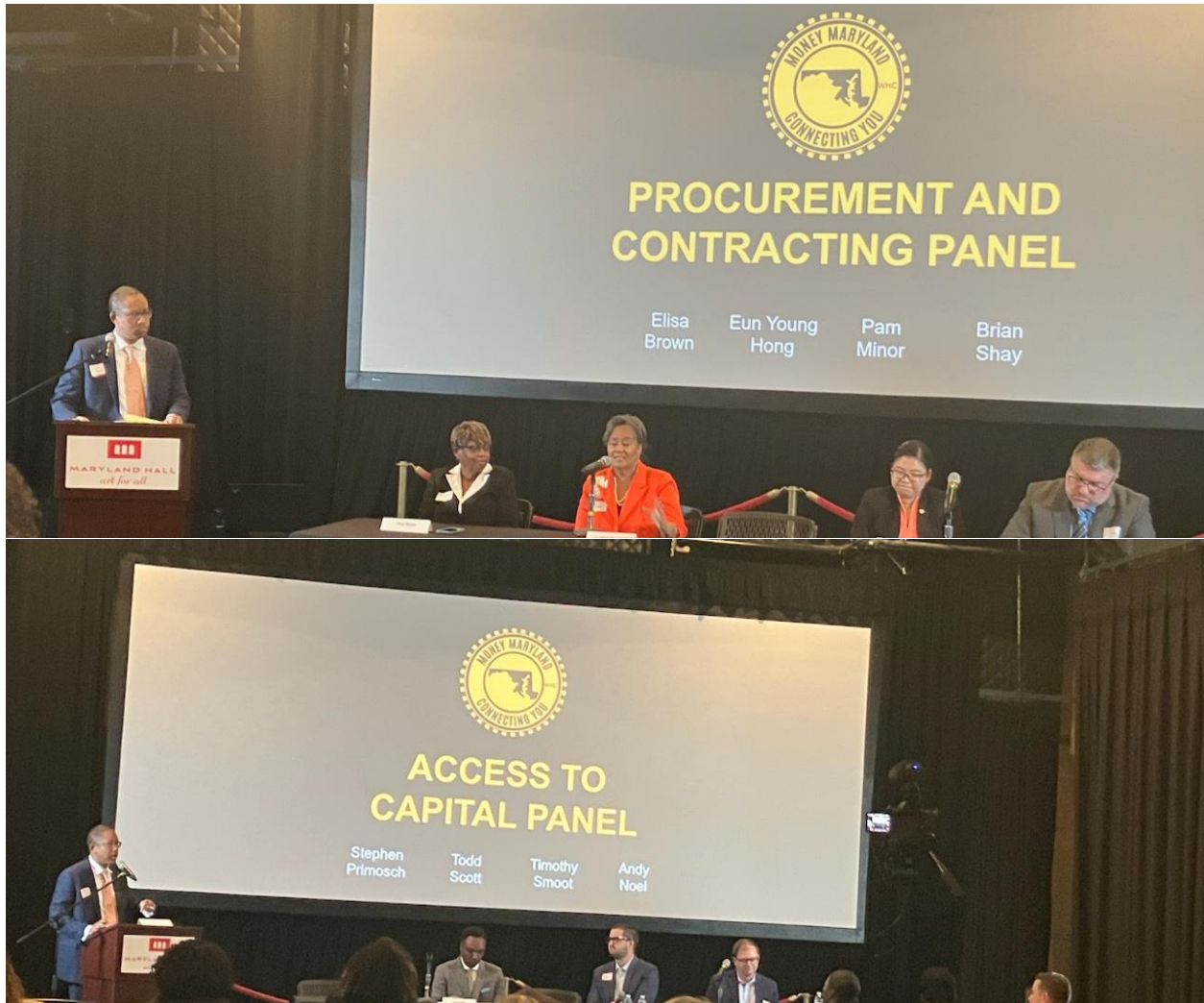
Money Maryland Event on September 15