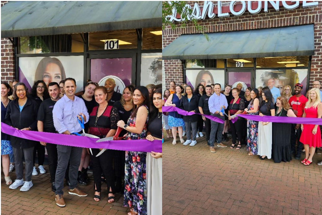
Lash Lounge Ribbon Cutting on September 21