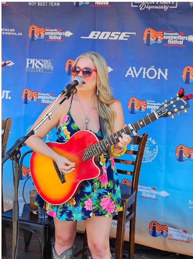
Annapolis Songwriters Festival on September 15