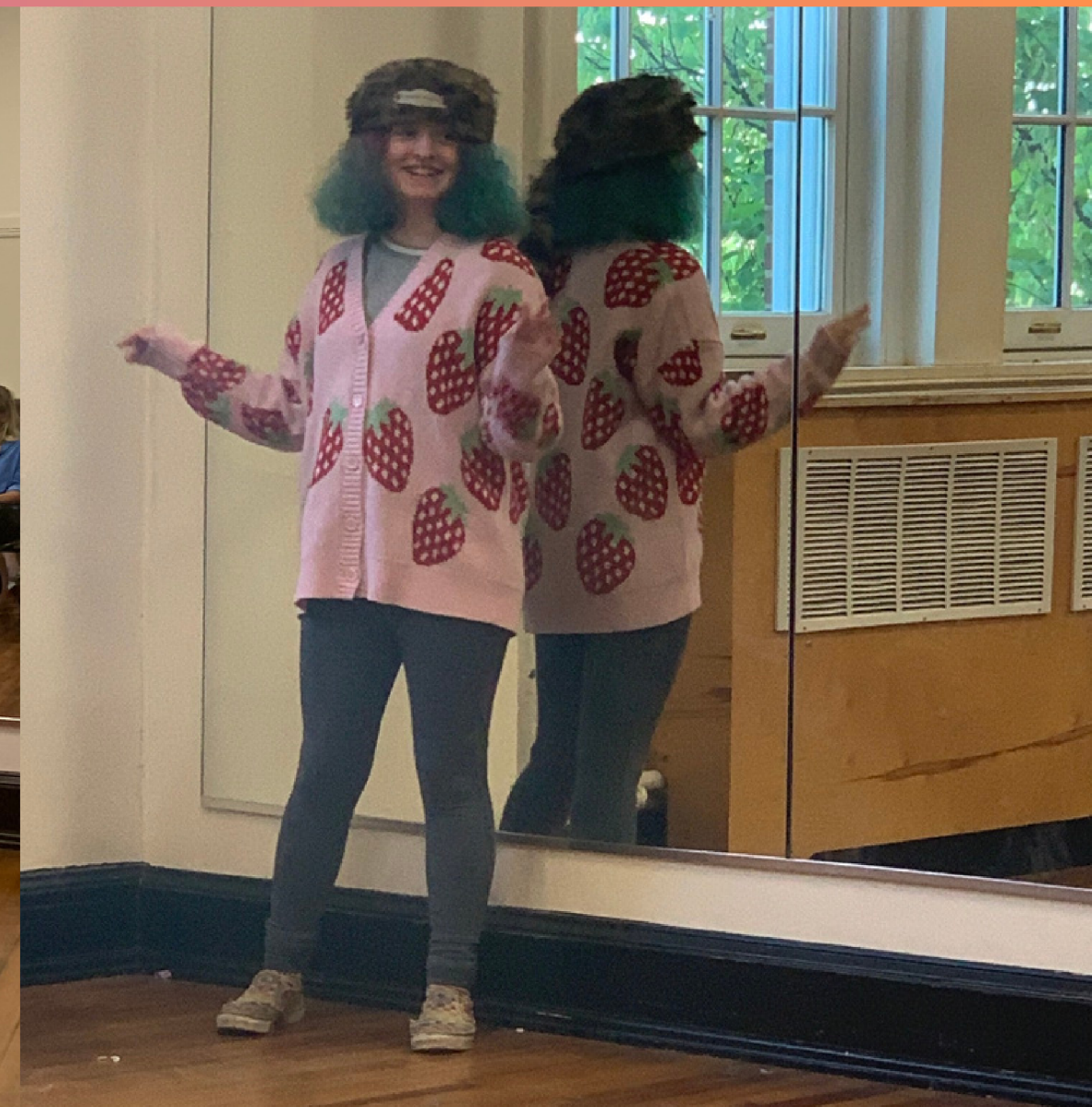
Teens Taking Improv Classes