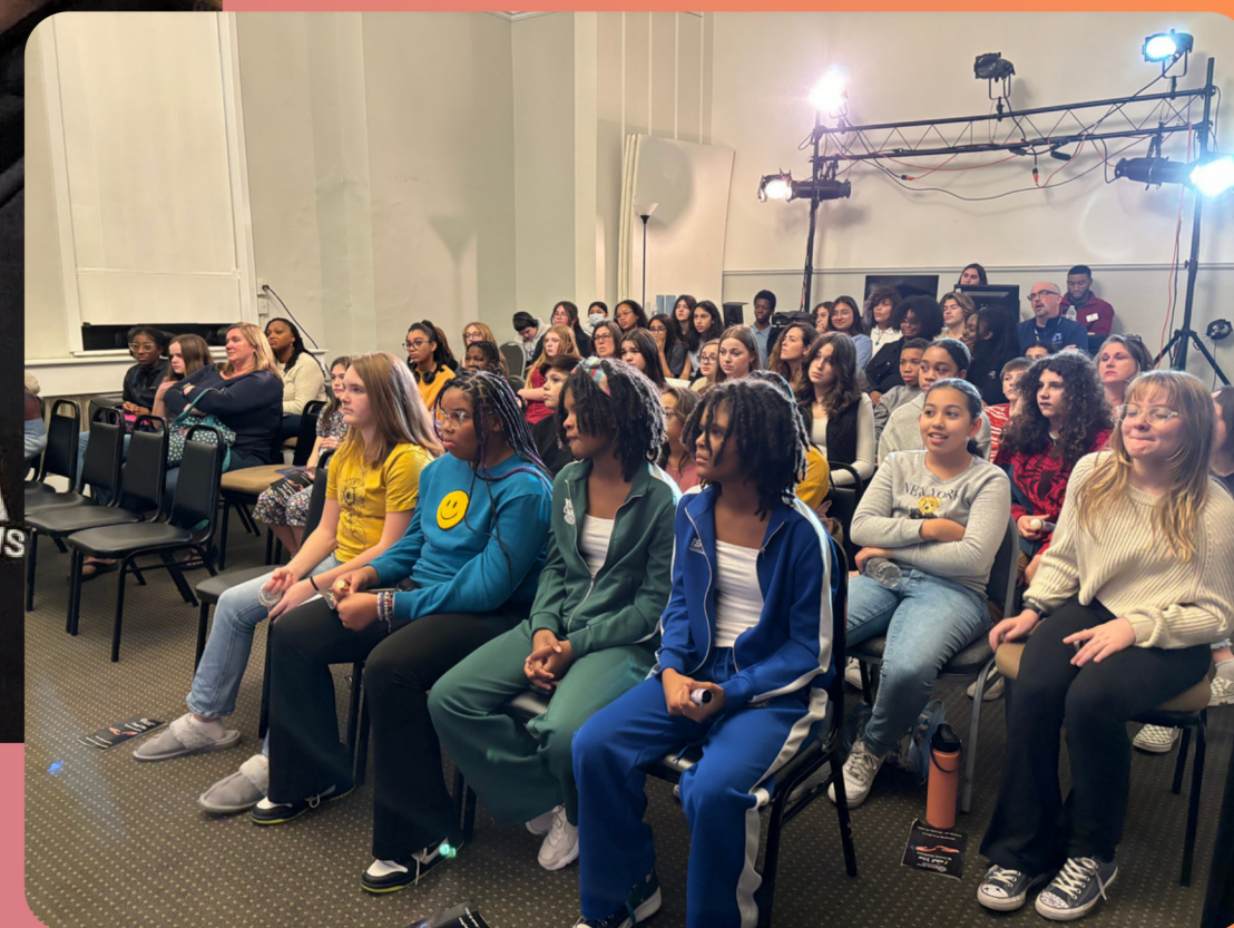
Apex Students Visit Compass Rose Theater Production of “I and You” by Lauren Gunderson