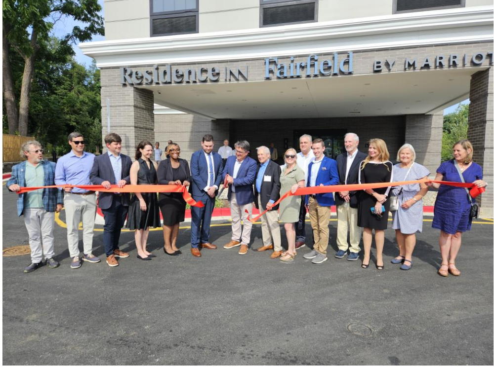
Fairfield / Residence Inn Ribbon Cutting on June 25