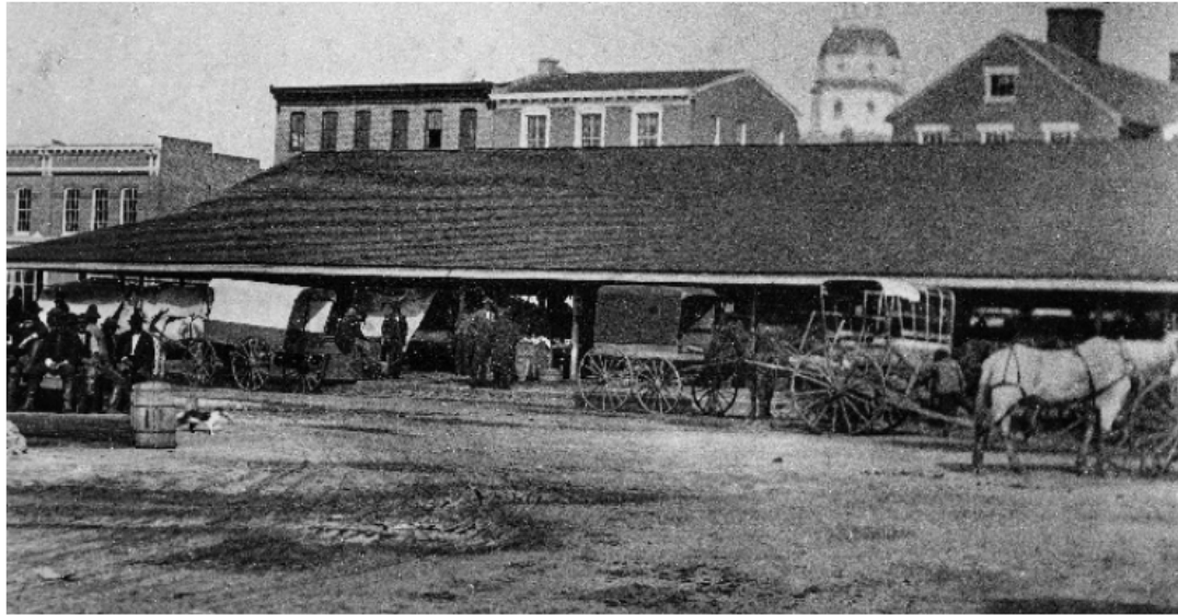
Market House, c. 1885. Horse-drawn wagons carried goods to and from the market in the late 19th century. City Code required drivers to stay on the right side of the street, to hold their reins, and to restrain their horses from "running, galloping, or going at an immoderate gait."