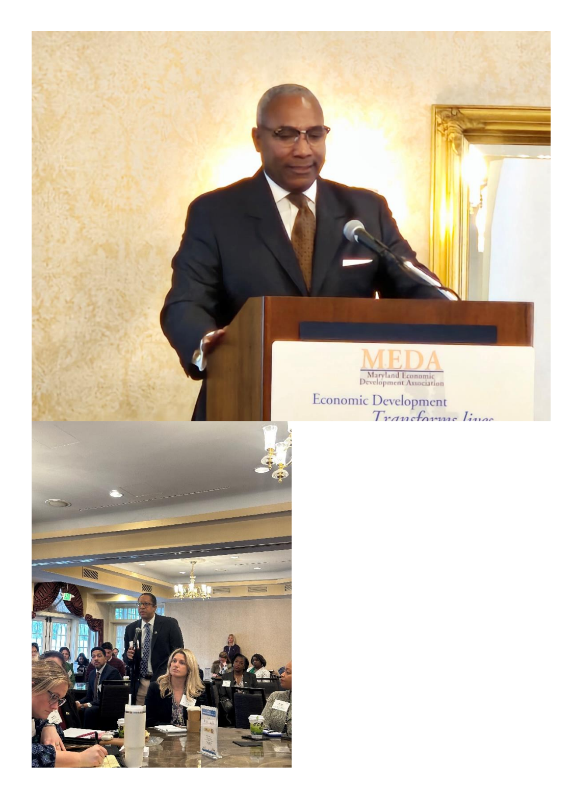
Economic Development Day in Annapolis