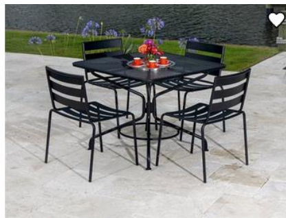
Woodard Cafe Series Wrought Iron Textured Black Dining Set