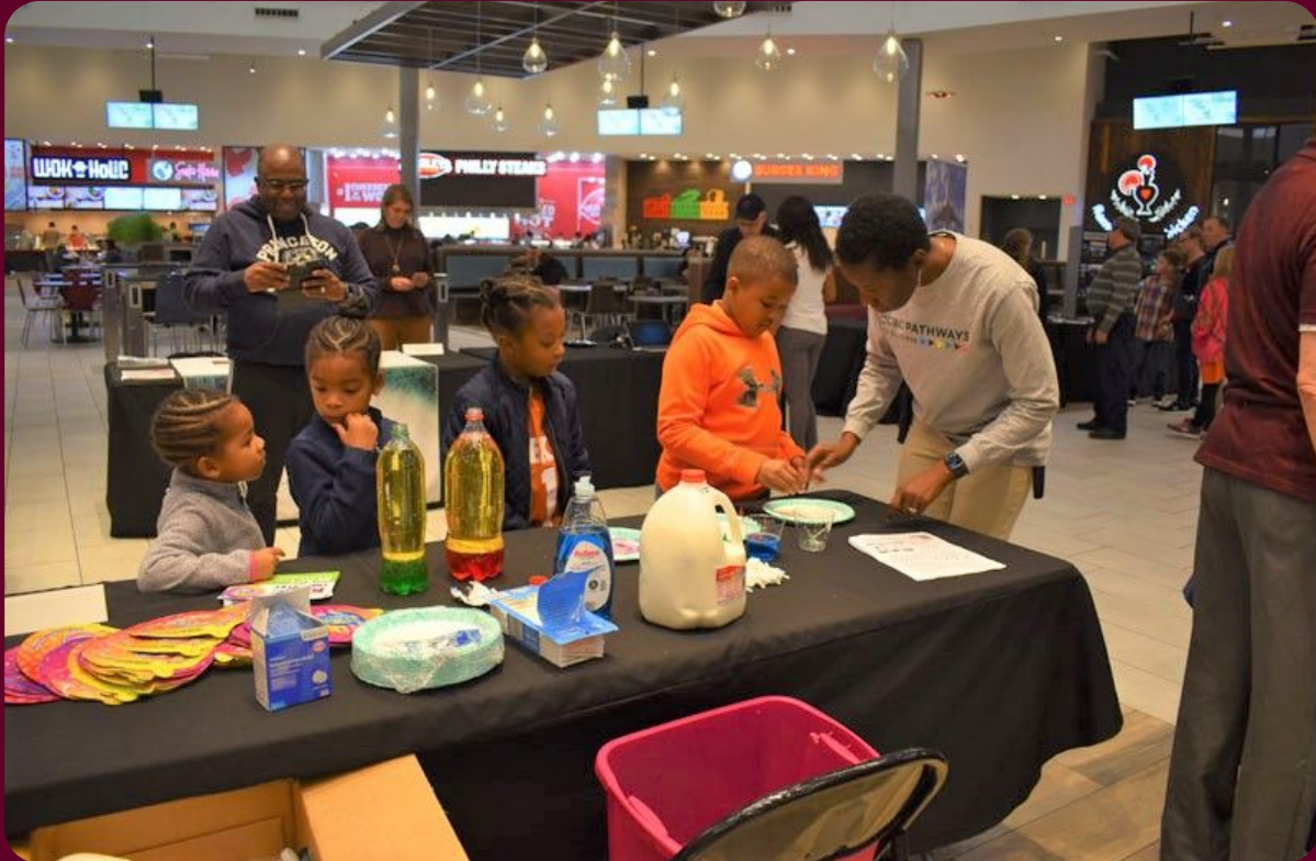
FAMILY STEM NIGHTS