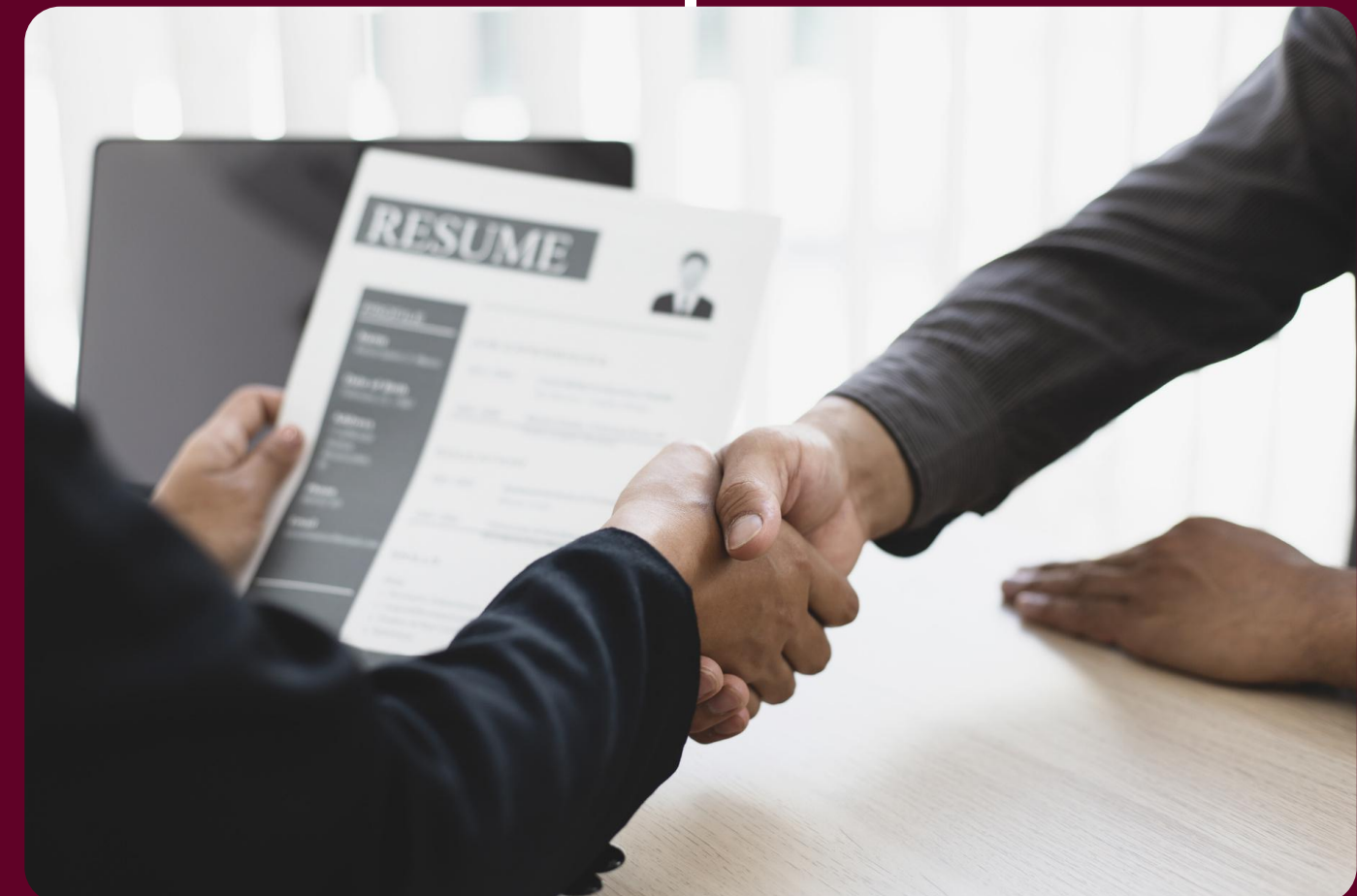
CAREER TRANSITION PROGRAM