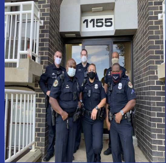
Harbor House-1155 Madison St, S4