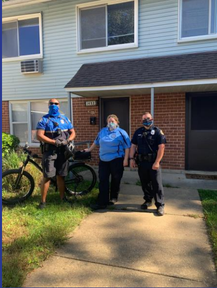
Robinwood-1453 Tyler Ave

Through a partnership with the Housing Authority of the City of Annapolis (HACA) and the Mayor's Office the Department has established two Resource Centers.