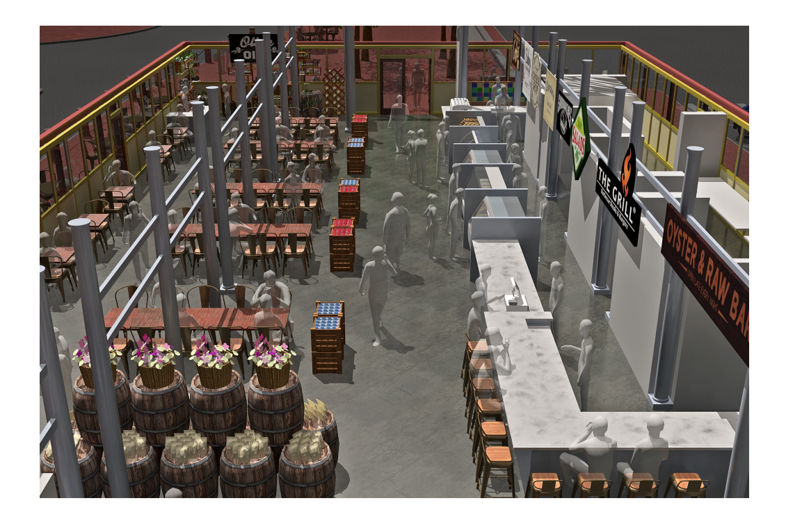
Interior Conceptual Drawings showing counter/stall locations and Grocery concept

Interior Conceptual Drawings showing counter/stall locations and communal seating