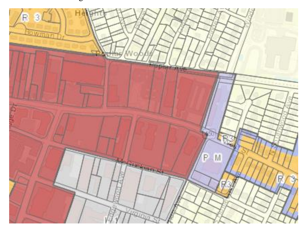
West Street between Westgate Circle and McKendree Avenue